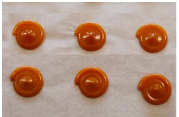
Mixing result eco-DUOMIX (dynamic mixing)